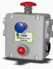
Type : GLES - SS