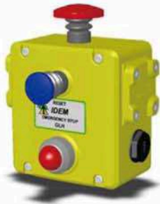
Type : GLES