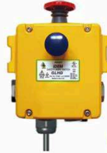
Type : GLES - Ex