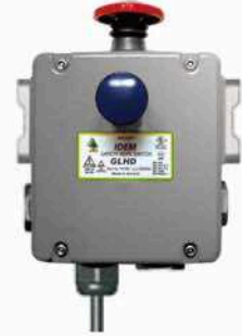
Type : GLES - SS - Ex